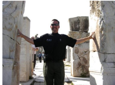
between, divided by