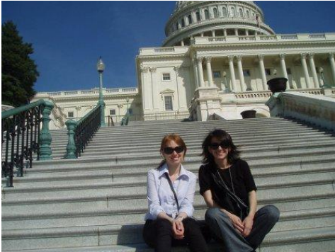
in front of